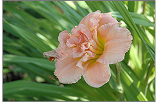
Siloam Double Delight Daylily flowers