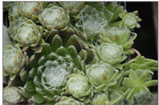
Cobweb Buttons Hens And Chicks