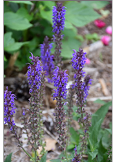
Blue By You Meadow Sage flowers

Blue By You Meadow Sage is recommended for the following landscape applications;