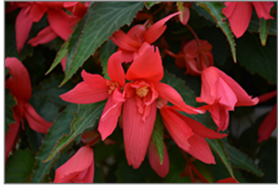
Bossa Nova Rose Shades Begonia flowers