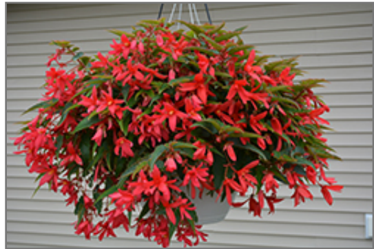
Bossa Nova Rose Shades Begonia in bloom

The Original Family-Owned Garden Center 4320 Bridgeboro Road Moorestown, NJ 08057 Garden Center: (856) 461-0567 Landscaping: (856) 461-3359