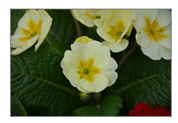
Orion Light Yellow Primrose flowers