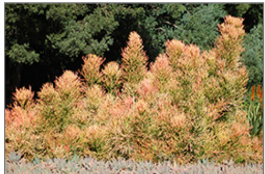
Sticks On Fire Red Pencil Tree

The Original Family-Owned Garden Center 4320 Bridgeboro Road Moorestown, NJ 08057 Garden Center: (856) 461-0567 Landscaping: (856) 461-3359