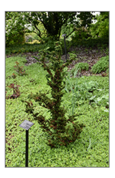
Chirimen Hinoki Falsecypress