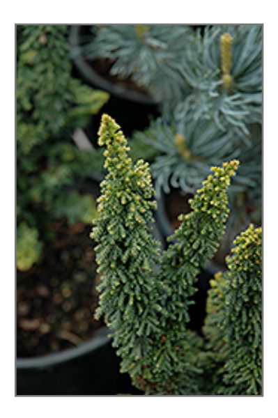
Chirimen Hinoki Falsecypress foliage