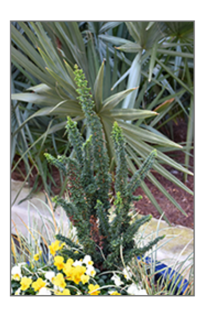
Chirimen Hinoki Falsecypress