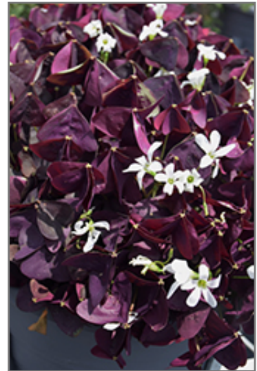
Charmed Wine Shamrock flowers

Charmed Wine Shamrock's attractive fan-shaped compound leaves remain plum purple in color throughout the season on a plant with a mounded habit of growth. It features subtle shell pink tubular flowers at the ends of the stems from late spring to early summer.