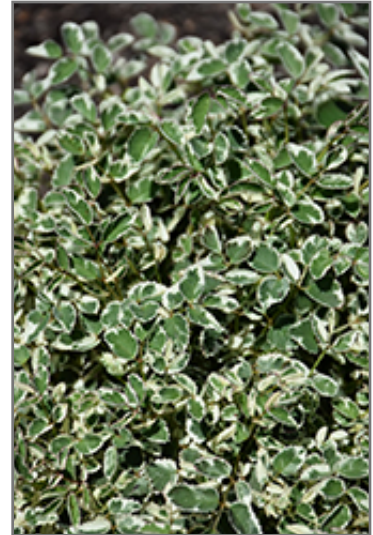
Little Angel Burnet flowers

This plant does best in full sun to partial shade. It prefers to grow in average to moist conditions, and shouldn't be allowed to dry out. It is not particular as to soil type or pH. It is somewhat tolerant of urban pollution. This is a selected variety of a species not originally from North America. It can be propagated by division; however, as a cultivated variety, be aware that it may be subject to certain restrictions or prohibitions on propagation.