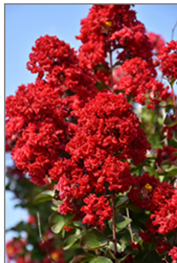
Dynamite Crapemyrtle flowers