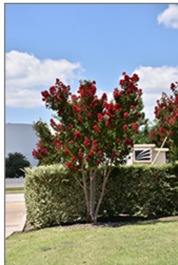
Dynamite Crapemyrtle in bloom