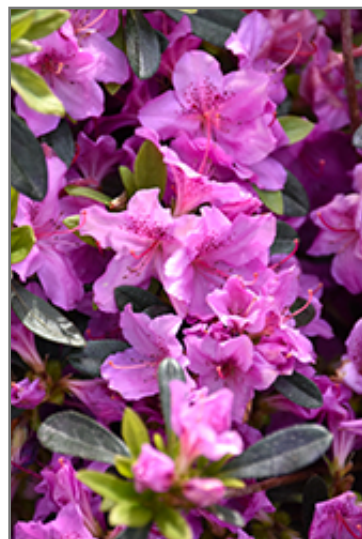
Karen Azalea flowers

Karen Azalea will grow to be about 4 feet tall at maturity, with a spread of 4 feet. It tends to be a little leggy, with a typical clearance of 1 foot from the ground. It grows at a slow rate, and under ideal conditions can be expected to live for 40 years or more.