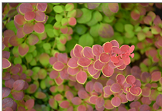
Sunjoy Tangelo Japanese Barberry foliage