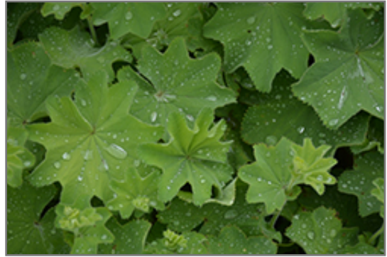
Lady's Mantle foliage

This plant performs well in both full sun and full shade. It is very adaptable to both dry and moist locations, and should do just fine under typical garden conditions. It is not particular as to soil type or pH. It is highly tolerant of urban pollution and will even thrive in inner city environments. This species is not originally from North America. It can be propagated by cuttings.