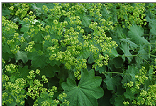
Lady's Mantle flowers

Lady's Mantle is recommended for the following landscape applications;