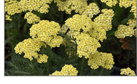
Sunny Seduction Yarrow flowers

Sunny Seduction Yarrow is covered in stunning lemon yellow flat-top flowers at the ends of the stems from early summer to early fall. The flowers are excellent for cutting. Its attractive tomentose ferny leaves remain grayish green in color throughout the season.