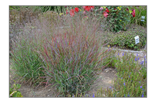
Cheyenne Sky Switch Grass

Cheyenne Sky Switch Grass is recommended for the following landscape applications;