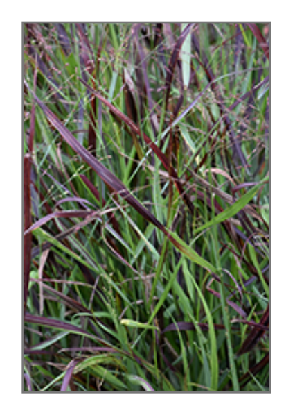
Cheyenne Sky Switch Grass flowers