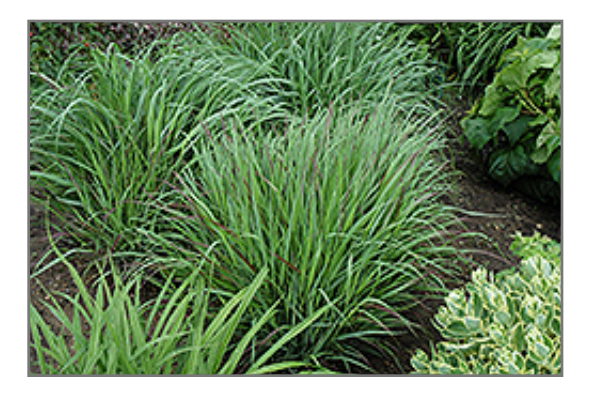
Cheyenne Sky Switch Grass

Cheyenne Sky Switch Grass will grow to be about 24 inches tall at maturity extending to 3 feet tall with the flowers, with a spread of 24 inches. It tends to be leggy, with a typical clearance of 1 foot from the ground, and should be underplanted with lower-growing perennials. It grows at a medium rate, and under ideal conditions can be expected to live for approximately 15 years. As an herbaceous perennial, this plant will usually die back to the crown each winter, and will regrow from the base each spring. Be careful not to disturb the crown in late winter when it may not be readily seen!