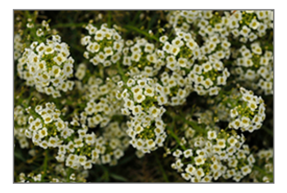
Moonlight Knight Alyssum flowers

Moonlight Knight Alyssum is recommended for the following landscape applications;