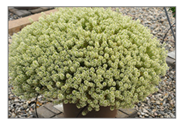
Moonlight Knight Alyssum in bloom