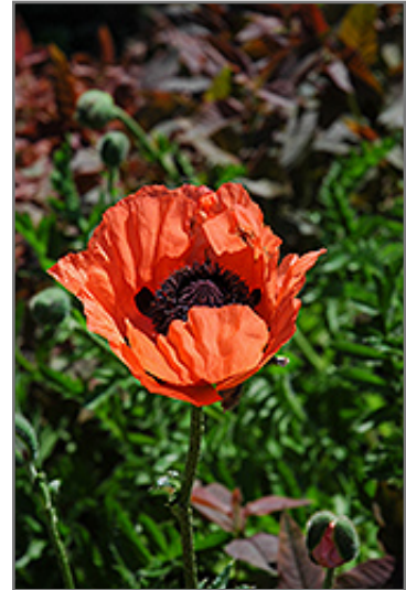
Carneum Poppy flowers

Carneum Poppy features bold salmon round flowers with burgundy eyes and black centers at the ends of the stems from early to mid summer. The flowers are excellent for cutting. Its deeply cut ferny leaves remain forest green in color throughout the season.