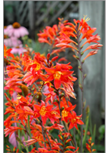
Prince Of Orange Crocosmia flowers

Prince Of Orange Crocosmia is recommended for the following landscape applications;