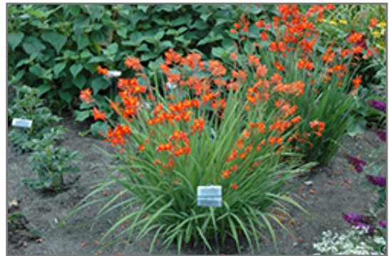
Prince Of Orange Crocosmia in bloom