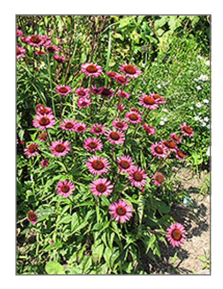
Vintage Wine Coneflower in bloom