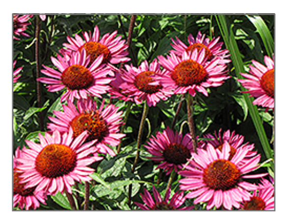
Vintage Wine Coneflower flowers