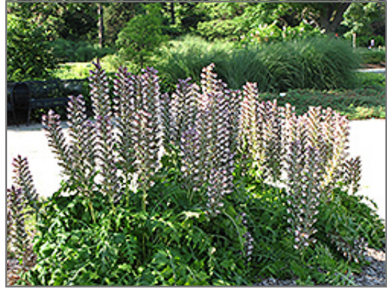
Hungarian Bear's Breeches in bloom

Hungarian Bear's Breeches is a fine choice for the garden, but it is also a good selection for planting in outdoor pots and containers. With its upright habit of growth, it is best suited for use as a 'thriller' in the 'spiller-thriller-filler' container combination; plant it near the center of the pot, surrounded by smaller plants and those that spill over the edges. It is even sizeable enough that it can be grown alone in a suitable container. Note that when growing plants in outdoor containers and baskets, they may require more frequent waterings than they would in the yard or garden. Be aware that in our climate, this plant may be too tender to survive the winter if left outdoors in a container. Contact our experts for more information on how to protect it over the winter months.