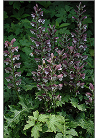
Hungarian Bear's Breeches in bloom

Hungarian Bear's Breeches is recommended for the following landscape applications;