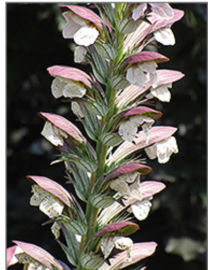
Hungarian Bear's Breeches flowers