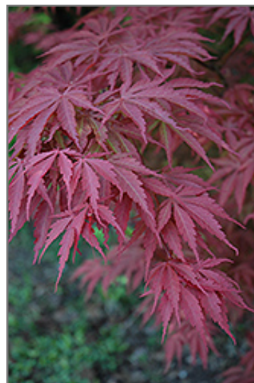
Chitose Yama Japanese Maple foliage

Chitose Yama Japanese Maple will grow to be about 15 feet tall at maturity, with a spread of 15 feet. It has a low canopy with a typical clearance of 2 feet from the ground, and is suitable for planting under power lines. It grows at a medium rate, and under ideal conditions can be expected to live for 60 years or more.