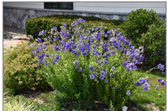
Astra Double Blue Balloon Flower in bloom