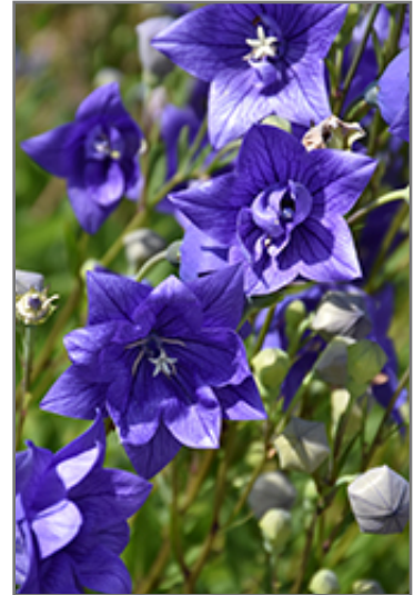
Astra Double Blue Balloon Flower flowers

Astra Double Blue Balloon Flower is recommended for the following landscape applications;