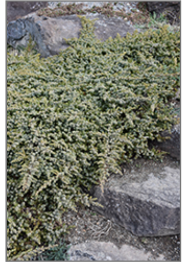
Silver Mist Juniper

This shrub does best in full sun to partial shade. It does best in average to evenly moist conditions, but will not tolerate standing water. It is not particular as to soil type or pH, and is able to handle environmental salt. It is highly tolerant of urban pollution and will even thrive in inner city environments. This is a selected variety of a species not originally from North America.