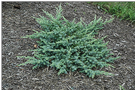
Silver Mist Juniper