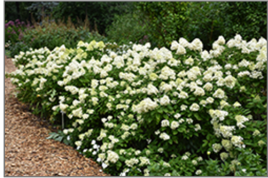
Limelight Prime Hydrangea in bloom