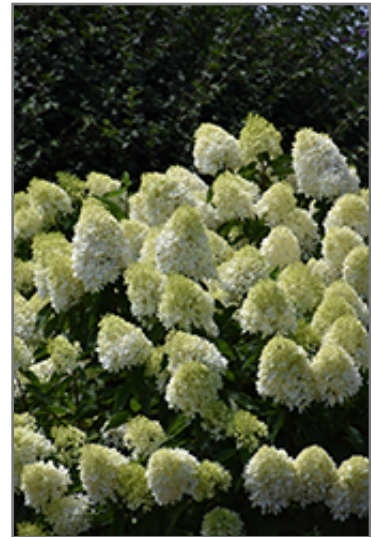
Limelight Prime Hydrangea flowers