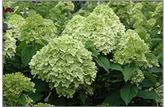
Limelight Prime Hydrangea flowers

This shrub performs well in both full sun and full shade. It prefers to grow in average to moist conditions, and shouldn't be allowed to dry out. It is not particular as to soil type or pH. It is highly tolerant of urban pollution and will even thrive in inner city environments. Consider applying a thick mulch around the root zone in winter to protect it in exposed locations or colder microclimates. This is a selected variety of a species not originally from North America.