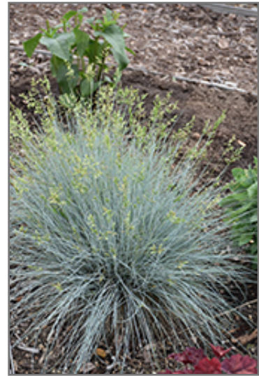
Blue Whiskers Blue Fescue