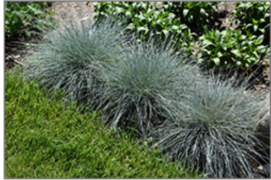
Blue Whiskers Blue Fescue

Blue Whiskers Blue Fescue is recommended for the following landscape applications;