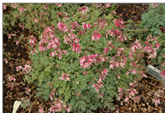
Pink Diamonds Fern-leaved Bleeding Heart in bloom