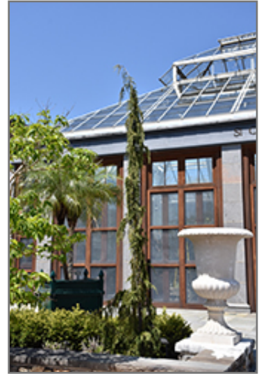
Stricta Weeping Nootka Cypress