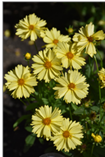
Leading Lady Lauren Tickseed flowers