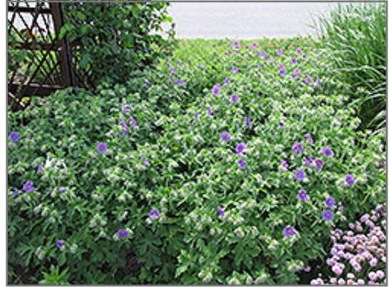
Showy Cranesbill in bloom

Showy Cranesbill will grow to be about 18 inches tall at maturity, with a spread of 24 inches. When grown in masses or used as a bedding plant, individual plants should be spaced approximately 20 inches apart. Its foliage tends to remain dense right to the ground, not requiring facer plants in front. It grows at a medium rate, and under ideal conditions can be expected to live for approximately 10 years. As an herbaceous perennial, this plant will usually die back to the crown each winter, and will regrow from the base each spring. Be careful not to disturb the crown in late winter when it may not be readily seen!