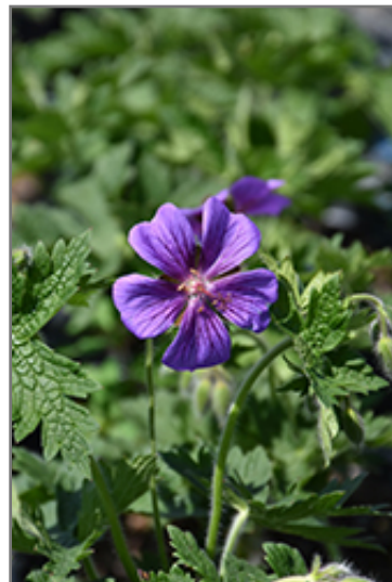
Showy Cranesbill flowers

Showy Cranesbill is recommended for the following landscape applications;