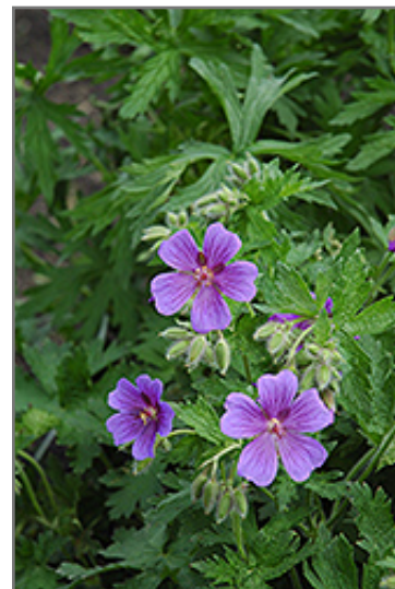
Showy Cranesbill flowers