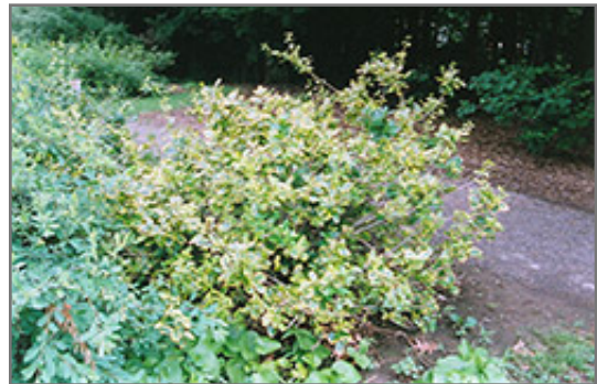
E.T. Gold Wintercreeper