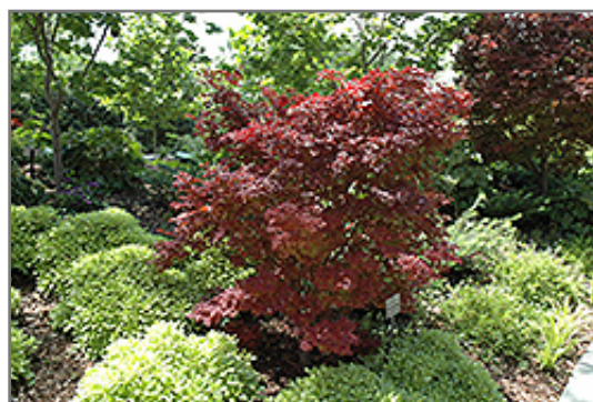
Adrians Compact Japanese Maple