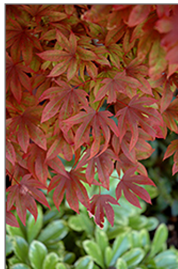
Adrians Compact Japanese Maple foliage