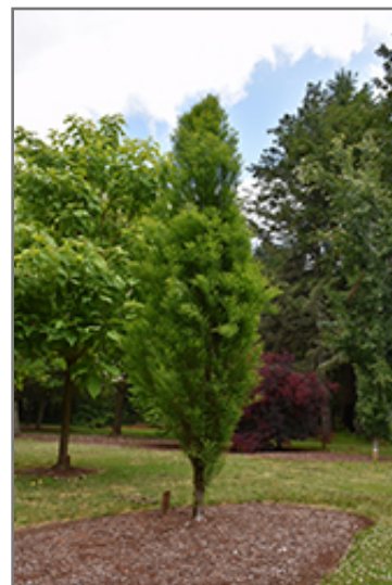
Lindsey's Skyward Bald Cypress