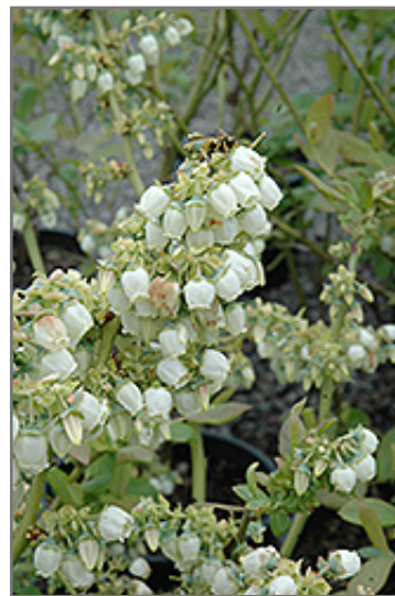
Blueray Blueberry flowers