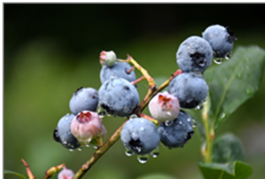
Blueray Blueberry fruit

Blueray Blueberry features dainty clusters of shell pink bell-shaped flowers with pink overtones hanging below the branches in mid spring. It has green deciduous foliage. The glossy oval leaves turn an outstanding purple in the fall. It features an abundance of magnificent blue berries from early to mid summer. The smooth brick red bark adds an interesting dimension to the landscape.