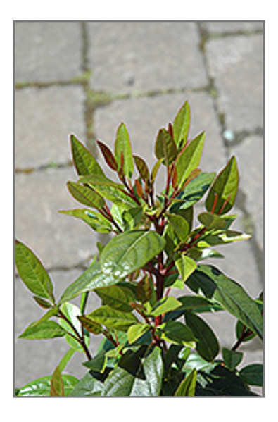
Spirit Laurustinus foliage

This shrub does best in full sun to partial shade. It is very adaptable to both dry and moist locations, and should do just fine under average home landscape conditions. It is not particular as to soil type or pH, and is able to handle environmental salt. It is highly tolerant of urban pollution and will even thrive in inner city environments. This is a selected variety of a species not originally from North America.