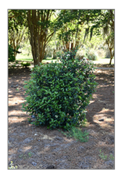
Spirit Laurustinus