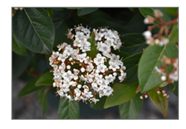
Spirit Laurustinus flowers

This is a relatively low maintenance shrub, and should only be pruned after flowering to avoid removing any of the current season's flowers. It is a good choice for attracting birds to your yard, but is not particularly attractive to deer who tend to leave it alone in favor of tastier treats. It has no significant negative characteristics.