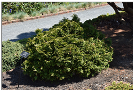
Grune Kugel Arborvitae