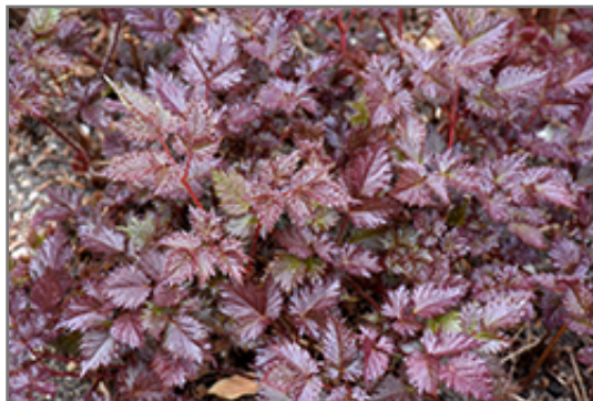
Delft Lace Astilbe foliage