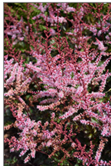
Delft Lace Astilbe flowers

Delft Lace Astilbe is an herbaceous perennial with an upright spreading habit of growth. Its relatively fine texture sets it apart from other garden plants with less refined foliage.