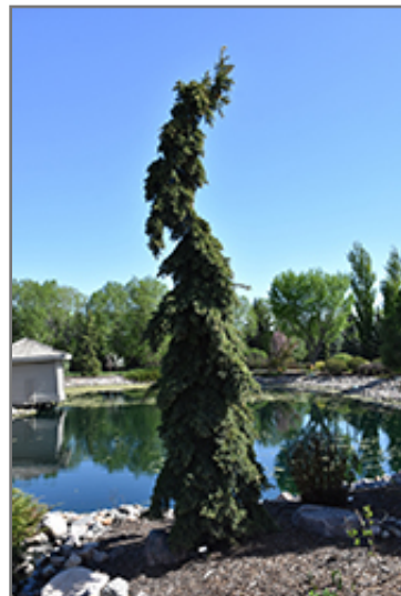
Weeping White Spruce

This tree does best in full sun to partial shade. It prefers to grow in average to moist conditions, and shouldn't be allowed to dry out. It is not particular as to soil type or pH. It is somewhat tolerant of urban pollution, and will benefit from being planted in a relatively sheltered location. This is a selection of a native North American species.