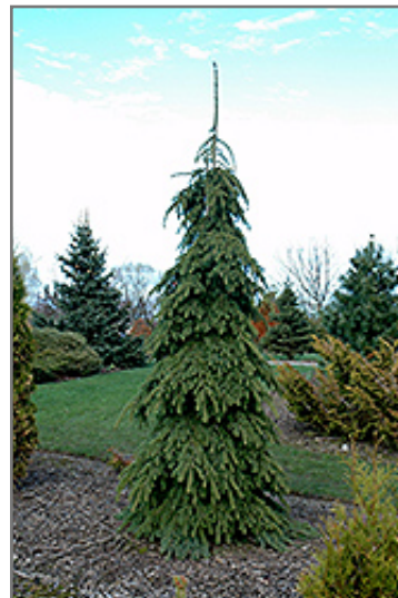
Weeping White Spruce