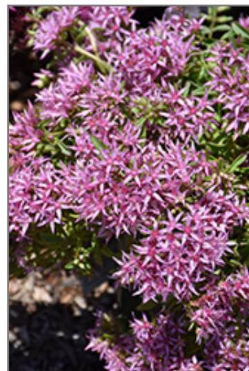
Spot On Pink Stonecrop flowers

This plant will require occasional maintenance and upkeep, and is best cleaned up in early spring before it resumes active growth for the season. Deer don't particularly care for this plant and will usually leave it alone in favor of tastier treats. Gardeners should be aware of the following characteristic(s) that may warrant special consideration;