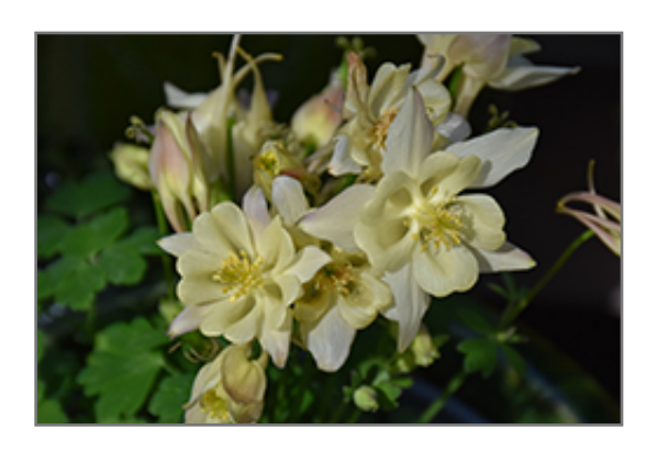
Earlybird Yellow Columbine flowers