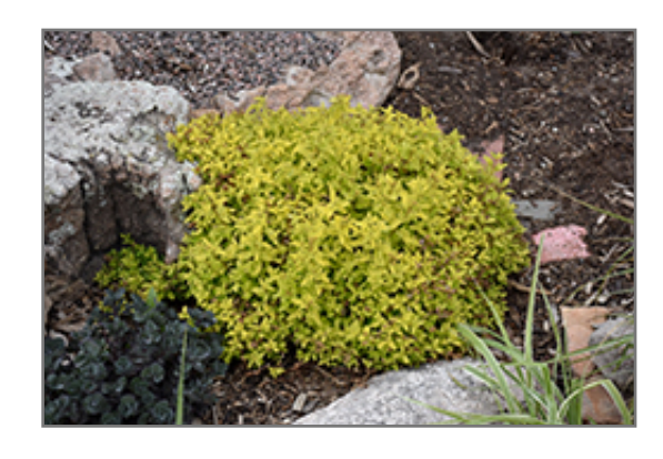
Lil' Sizzle Spirea

This shrub will require occasional maintenance and upkeep, and is best pruned in late winter once the threat of extreme cold has passed. It is a good choice for attracting butterflies to your yard, but is not particularly attractive to deer who tend to leave it alone in favor of tastier treats. It has no significant negative characteristics.