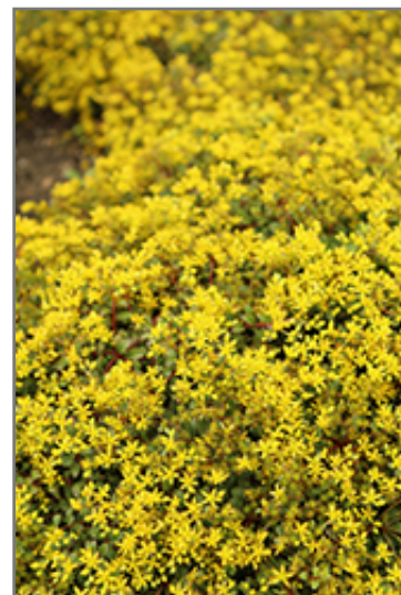
Rock 'N Low Yellow Brick Road Stonecrop flowers

Rock 'N Low Yellow Brick Road Stonecrop is a dense herbaceous perennial with a mounded form. Its relatively fine texture sets it apart from other garden plants with less refined foliage.