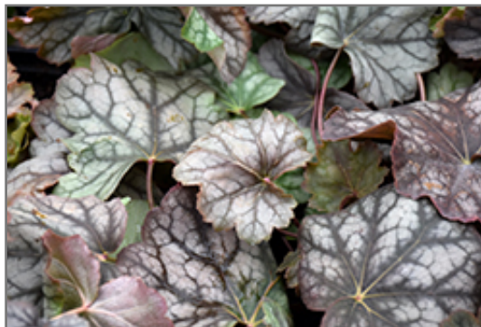
Dale's Strain Coral Bells foliage

Dale's Strain Coral Bells is recommended for the following landscape applications;