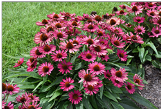
Kismet Raspberry Coneflower in bloom