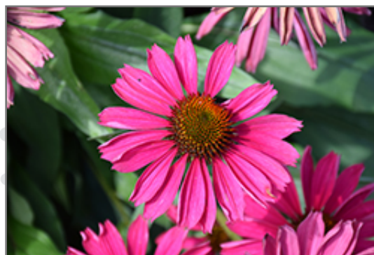
Kismet Raspberry Coneflower flowers