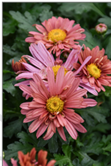
Coral Daisy Chrysanthemum flowers