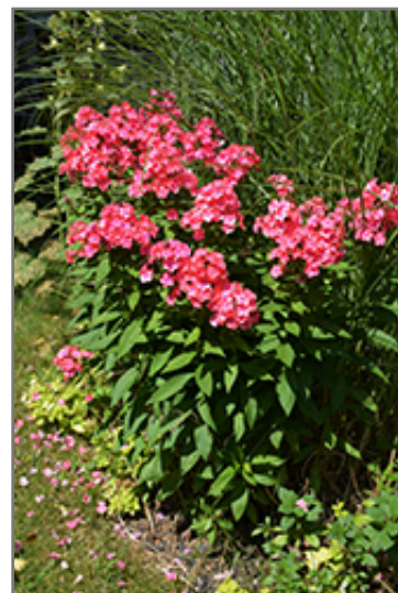
Flame Coral Garden Phlox in bloom