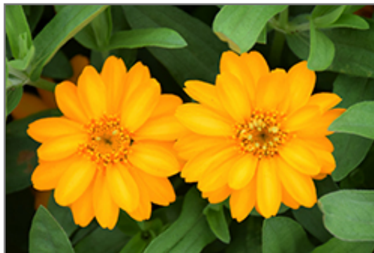
Profusion Double Golden Zinnia flowers

Profusion Double Golden Zinnia is recommended for the following landscape applications;