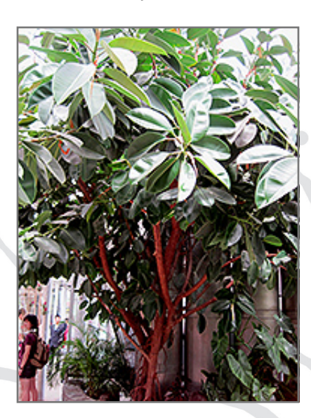
Rubber Tree