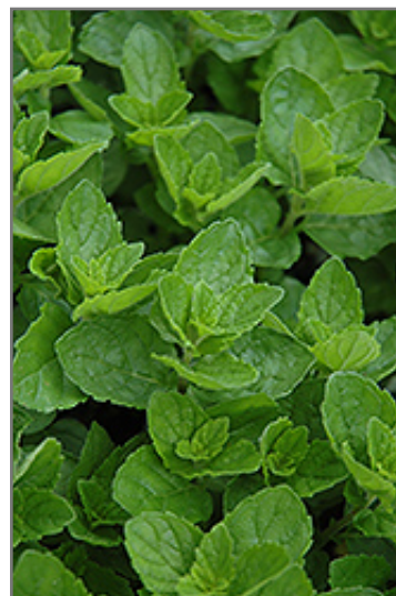
Spearmint foliage

Spearmint features bold spikes of lilac purple tubular flowers with white overtones rising above the foliage in late summer. Its attractive fragrant oval leaves remain green in color throughout the season.