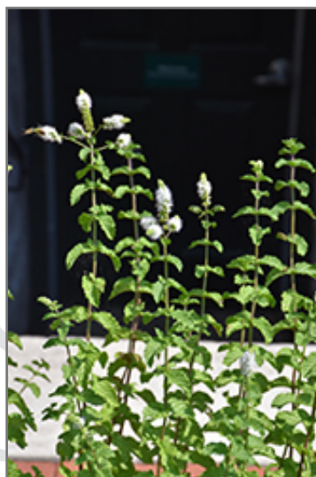
Spearmint flowers