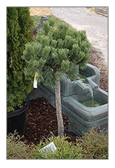
Dwarf Mugo Pine

10,000 Great Plains Blvd. Chaska, MN 55318 952-445-6555 www.TheMustardSeedInc.com contactus@themustardseedinc.com ...the birds of the air can perch in its shade. Mark 4:30-32