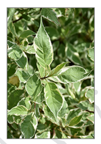
Silver Variegated Dogwood foliage

Silver Variegated Dogwood is a multi-stemmed deciduous shrub with a more or less rounded form. Its average texture blends into the landscape, but can be balanced by one or two finer or coarser trees or shrubs for an effective composition.