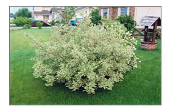
Silver Variegated Dogwood

One of the very hardiest of the variegated shrubs for garden use, although it can grow quite large for most gardens; also features stunning red stems which show up well against the winter snow; ideal for color accent in many landscaping applications